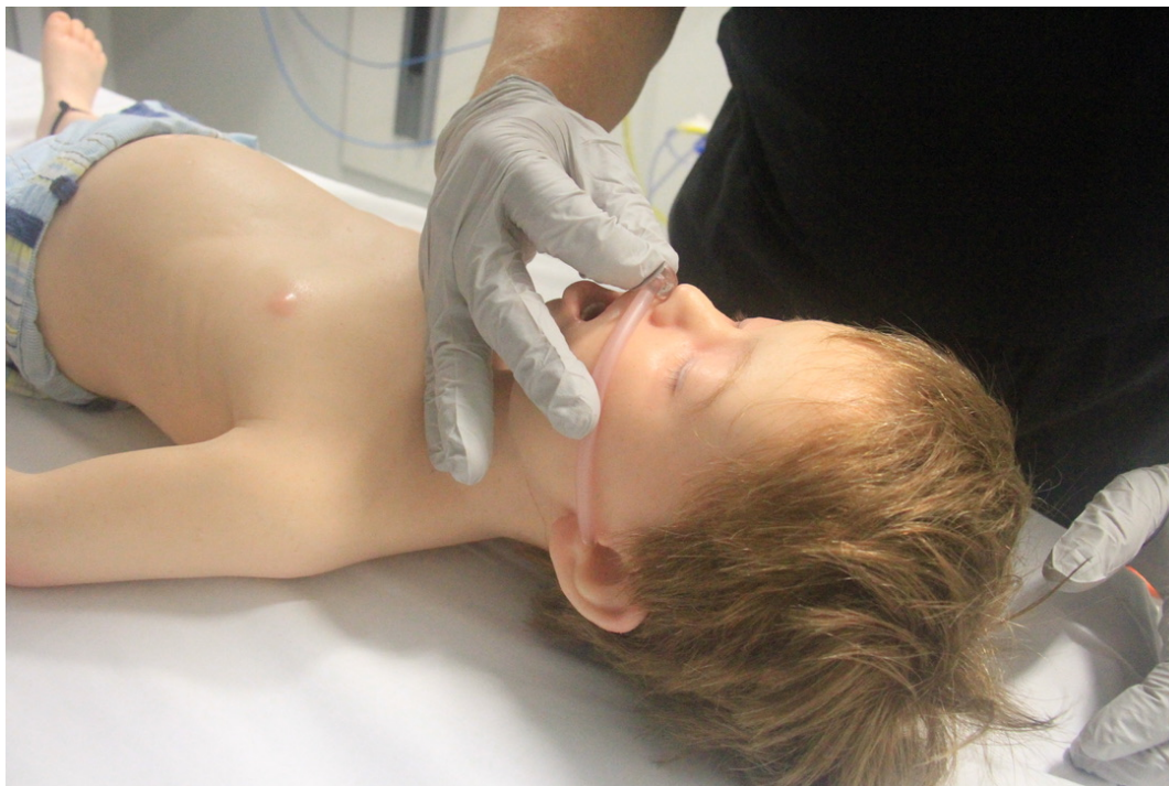
Figure 6: Sizing of naso-pharyngeal tube