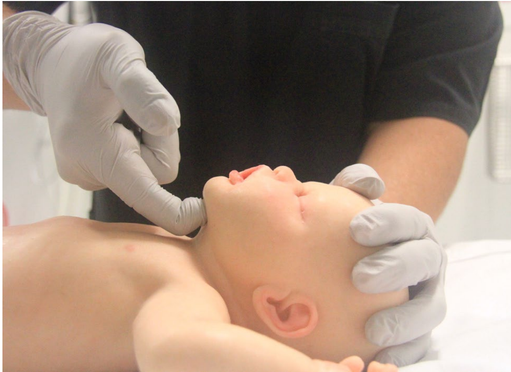
Figure 1: Head tilt with chin lift in an infant (neutral position)

The patency of the airway should be assessed by observation of movement of the chest and abdomen during breathing. An indrawing of the chest wall and/or distension of the abdomen with each inspiratory effort without expiration of air implies an obstructed airway.