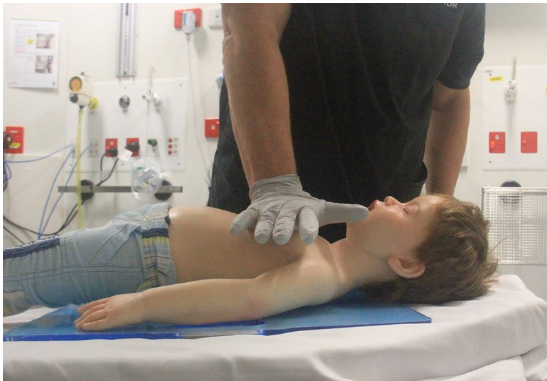
Figure 1: One-handed compression technique in a child

Approximately 50% of a compression cycle should be devoted to compression of the chest and 50% to relaxation to enable full recoil of the chest wall.