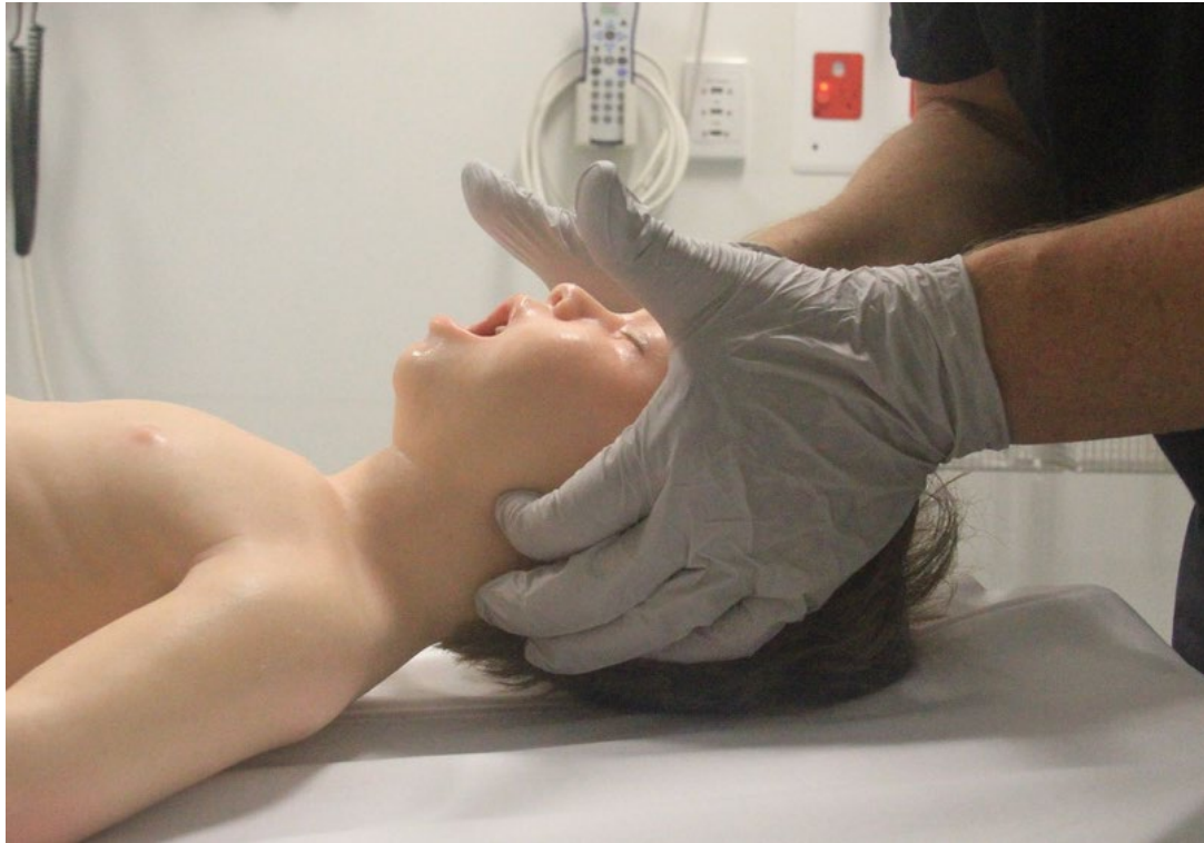
Figure 4: Jaw thrust in a child