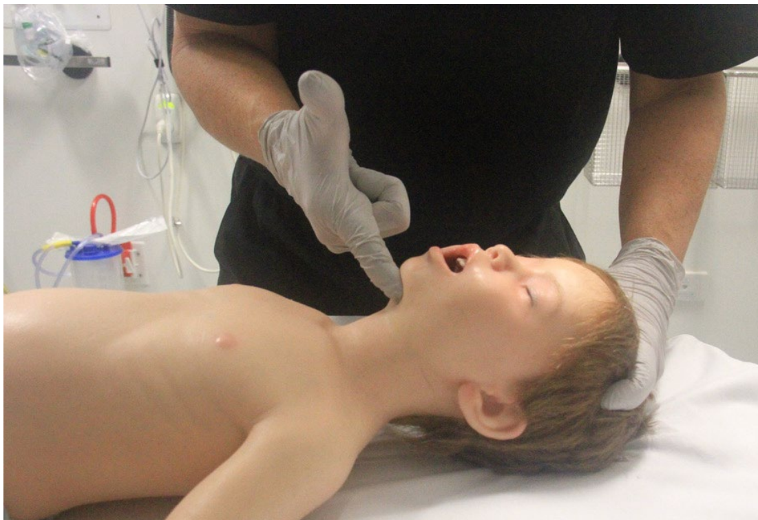
Figure 2: Head tilt with chin lift in a child (sniffing position)