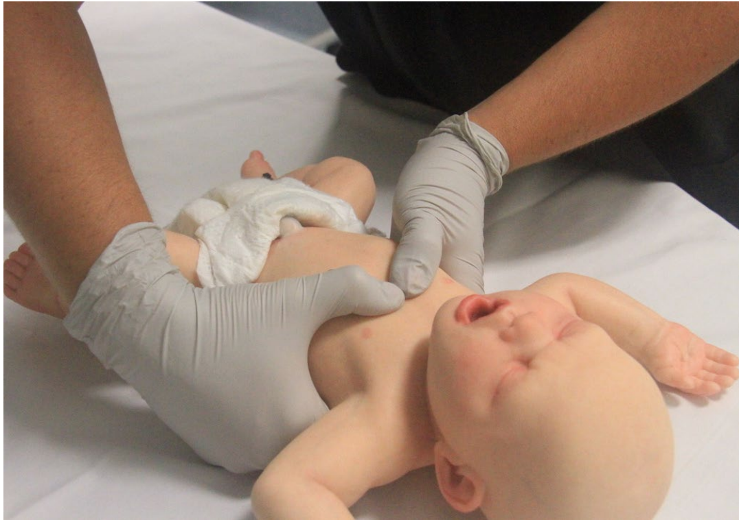
Figure 8: Two-thumb compression technique in an infant