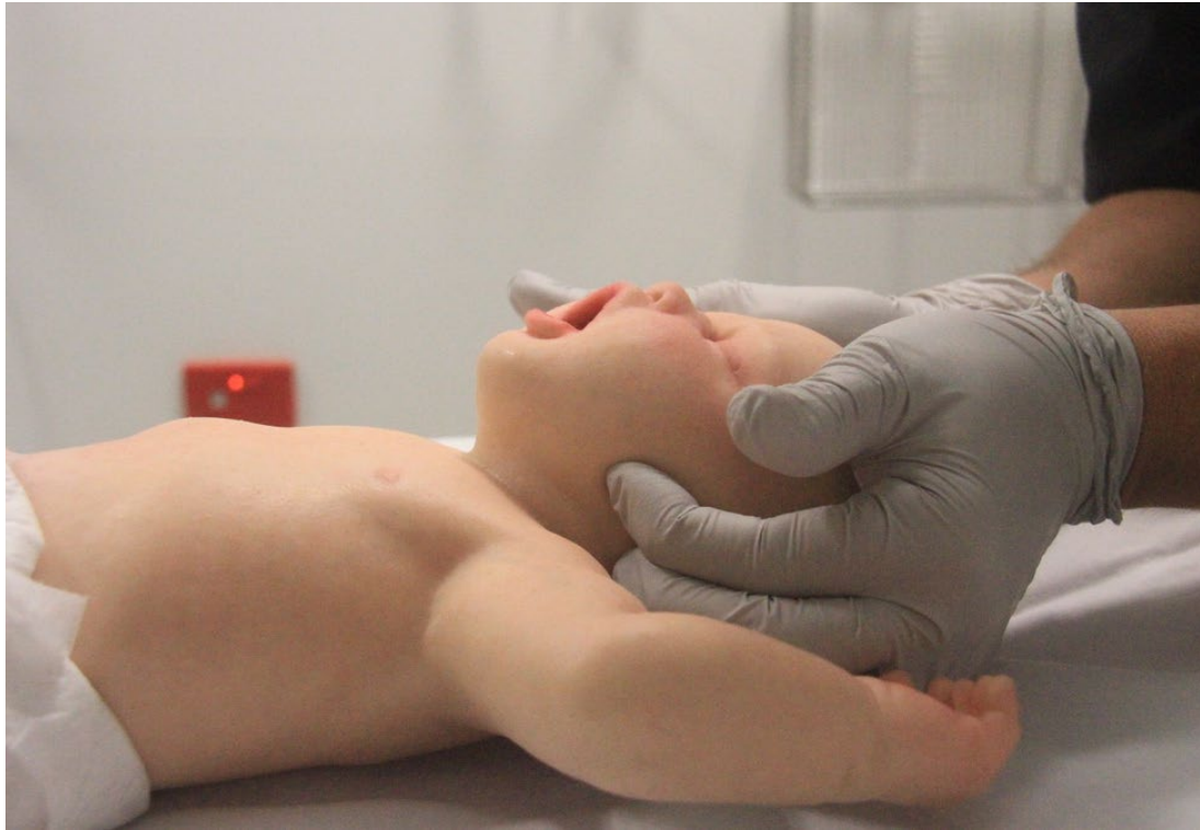
Figure 3: Jaw thrust in an infant