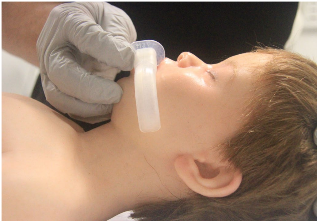
Figure 5: Sizing of oro-pharyngeal tube